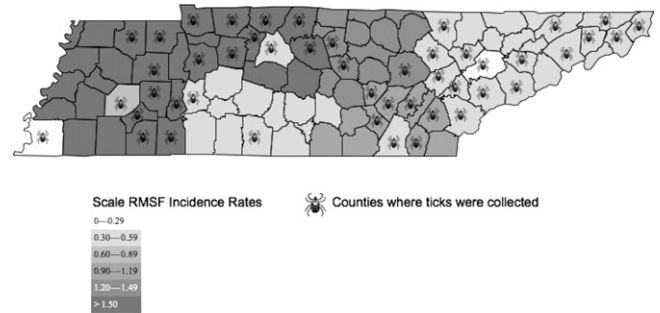
FIGURE 2. Human Rocky Mountain spotted fever (RMSF) incidence rates by county and tick collection by county.

the observation of increased infection rates of R. montana in D. variabilis in the two easternmost ecoregions of Tennessee is notable. The average human RMSF incidence rate for those two regions is 0.83 per 100,000, which is significantly lower than the Southeastern Plains of western Tennessee at 4.2 ( P < 0.001 ). Ticks are capable of maintaining naturally occurring mixed rickettsial infections as was shown in Ohio in 2006. 24 Although a causal relationship cannot be determined between high incidence of R. montana and low incidence of RMSF from this study, ecological factors such as interference may potentially impact the rickettsial transmission cycle.