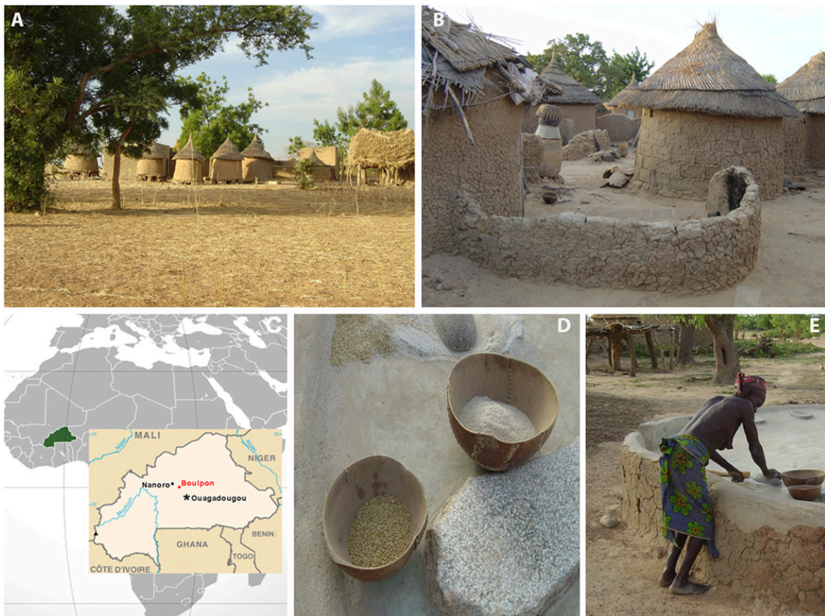
Fig. 1. Life in a rural village of Burkina Faso. (A) Village of Boulpon. (B) Traditional Mossi dwelling. (C) Map of Burkina Faso (modified from the United States CIA's World Factbook, 34). (D) Millet and sorghum (basic components of Mossi diet) grain and flour in typical bowls. (E) Millet and sorghum is ground into flour on a grinding stone to produce a thick porridge called Tô.

group (BF) living in the small village of Boulpon in Burkina Faso (Fig. 1) and compared it with that of 15 healthy European children (EU) living in the urban area of Florence, Italy (Table S1). The BF children from Boulpon village were selected as representative consumers of a traditional rural African diet. The diet of BF children is low in fat and animal protein and rich in starch, fiber, and plant polysaccharides, and predominantly vegetarian (Table S2). All food resources are completely produced locally, cultivated and harvested nearby the village by women. The BF diet consists mainly of cereals (millet grain, sorghum), legumes (black-eyed peas, called Niébé), and vegetables, so the content of carbohydrate, fiber and nonanimal protein is very high. Millet and sorghum are ground into flour on a flat stone and made into thick porridge called millet-based Tô, dipped into a sauce made of local vegetables (Néré) and herbs. Although the intake of animal protein is very low, sometimes they eat a small amount of meat (chicken) and termites that we verified to be occasionally part of the BF children's diet in the rainy season.