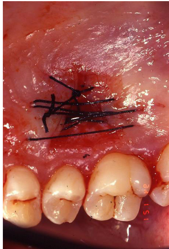
Figure 3 Palatal view of the donor site.

closed by three interrupted sutures in 3-0 silk (two at the borders and one in the centre) before grafting the recipient site.