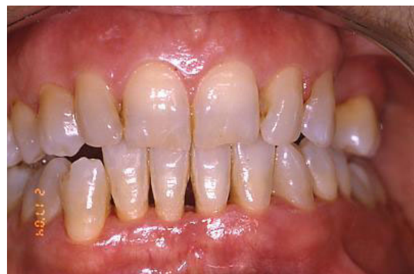
Figure 6 Follow-up at 10 years: an aesthetically satisfactory gingival appearance and no signs of recurrence.

The muco-gingival complex showed no functional or aesthetic damage and no bone reabsorption occurred,