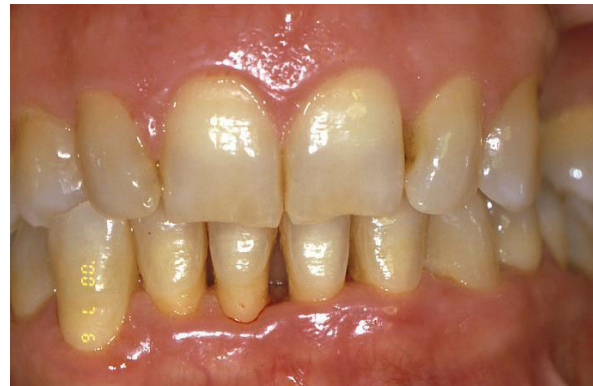
Figure 5 Follow-up at six years later.

The palatal mucosa in the premolar region is the ideal area for obtaining a graft for anatomic reasons [24], as an adequate thickness of the graft is ensured [25] without causing any damage to the greater palatine artery.