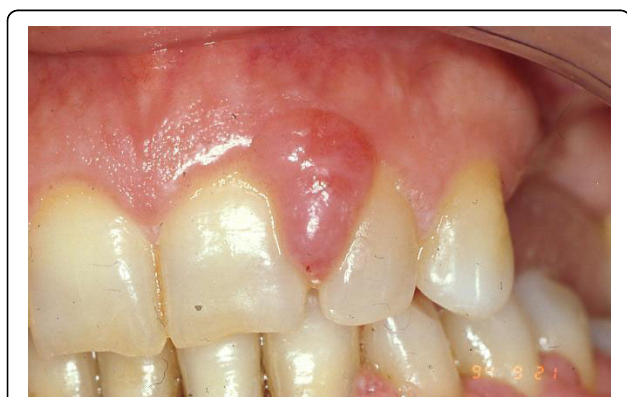
Figure 1 Intraoral view of gingival overgrowth.

Before non-surgical therapy, three different indexes of periodontal health were analyzed (for full mouth): probing depth (PD), plaque index according to O'Leary (PI) [21] and Gingival index according to Löe-Silness (GI) [22,23]. (Table 2)