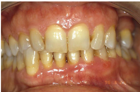
Figure 4 Clinical aspect two years after surgery.

Unlike the classic approach, the surgical technique here described involved the use of a free gingival graft obtained from the palatine mucosa to cover the tissue gap in the host site.