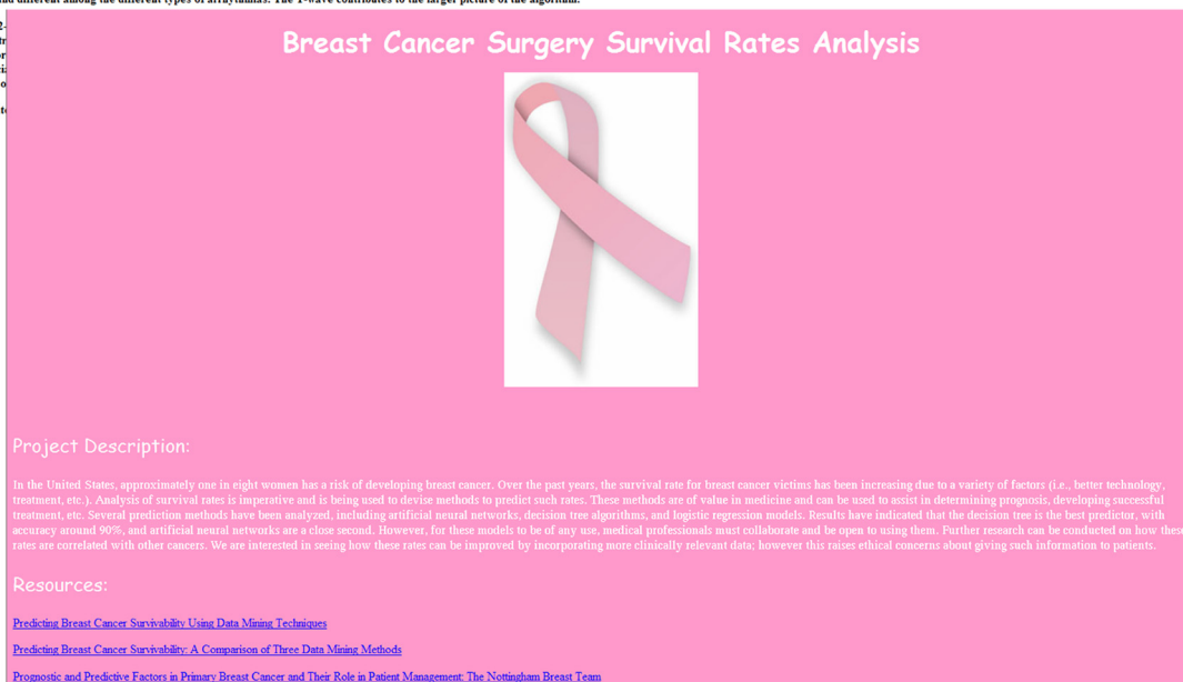
Figure 1. Virtual research project repository websites developed by the students in two selected groups.

Machine learned algorithm for arrhythmia analysis