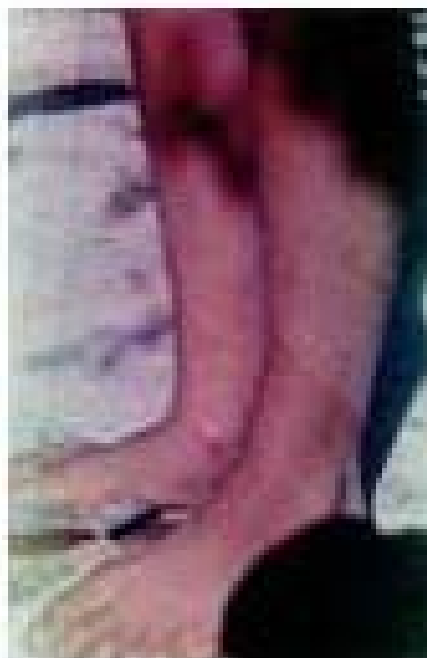
Figure 1 Maculopapular rash on hands and feet in cercarial dermatitis.