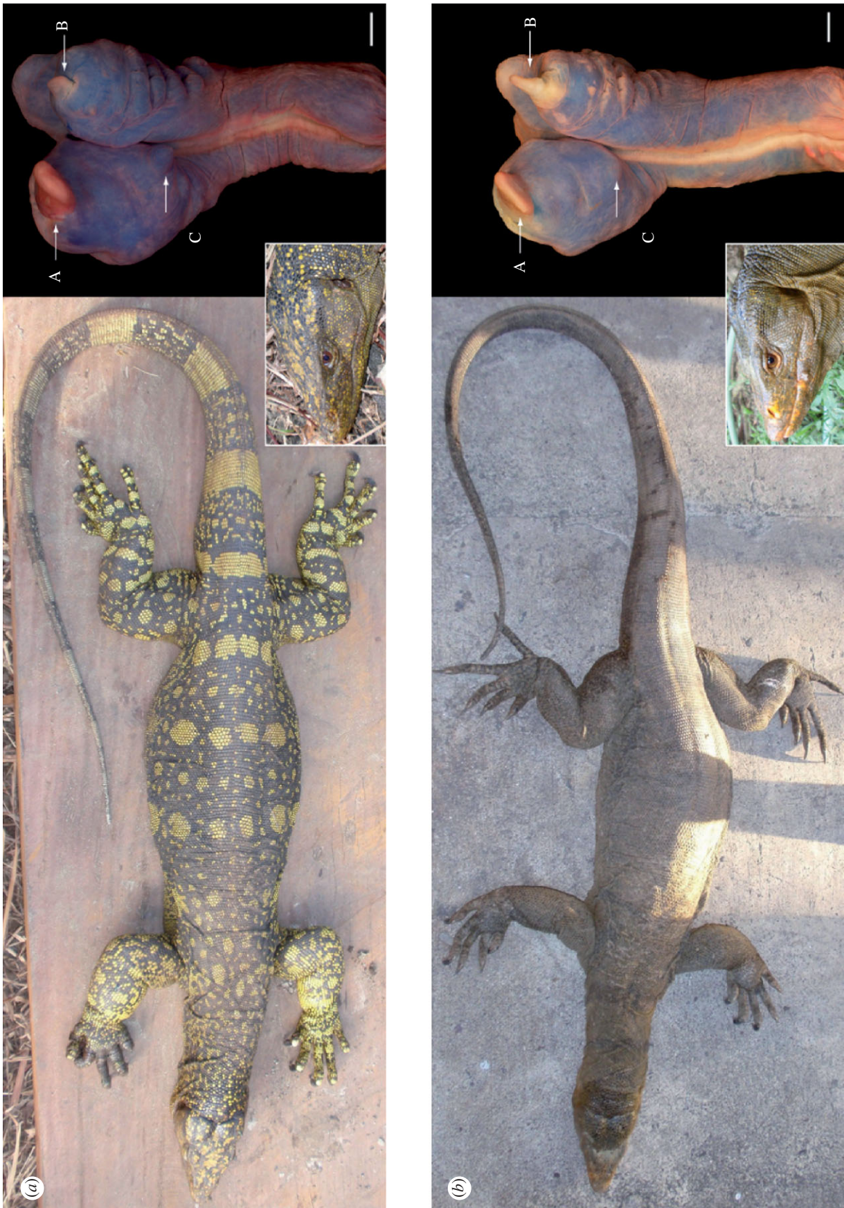
Figure 2. Dorsal views of bodies, lateral views of heads and close-ups of hemipenes of (a) V. bitatawa (PNM 9719) and (b) V. olivaceus (KU 322187). Letters indicate: A, primary apical hemibaculum horn; B, secondary apical hemibaculum horn; and C, presence or absence of an evagination at the base of the primary hemibaculum.