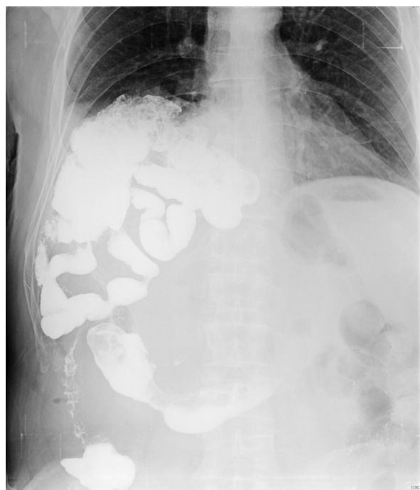
Figure 1 Barium study showing small bowel and right colon herniation into the right hemithorax behind the liver.

The patient underwent laparotomy, and herniation of the right colon and small intestine (40 mm in length) was seen. There were no ischemic changes or perforation, but the colon was slightly edematous. No resection of any part of the intestinal tract was necessary. The colon and the small intestine were reduced into the abdomen. As usual in traumatic lesions, there was absence of the hernial sack: the hernia opening was only