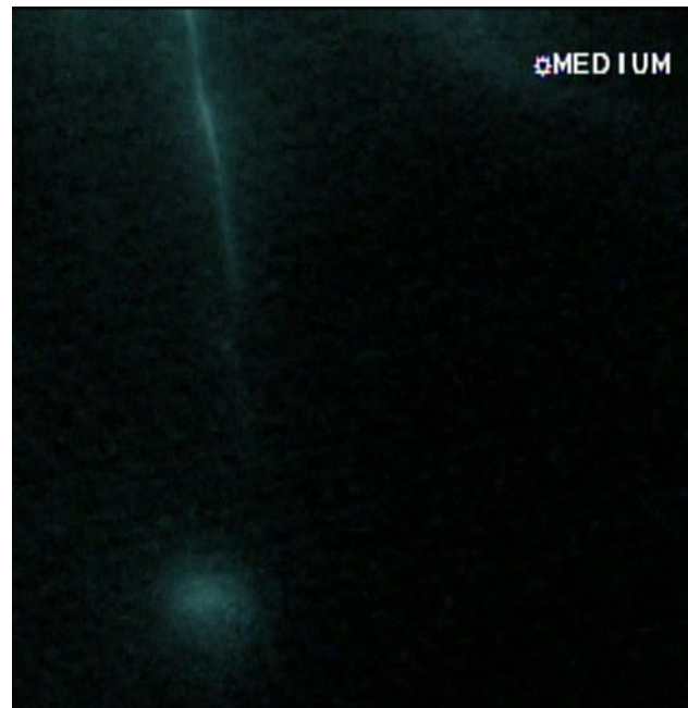
Fig. 1 View obtained during experiment 3 at 12 min after injection

Subsequent to the autopsy 2 h after injection, the sigmoid was examined in a laparoscopic training box. In both specimens, the sentinel nodes could be detected ex vivo . In one case, a second echelon lymph node was seen that had not been observed during the in vivo experiment. This discolored lymph node was located deep at the base of the