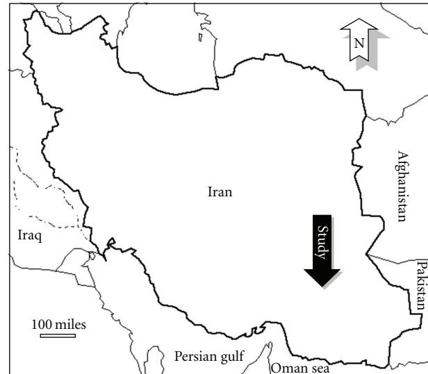
FIGURE 1: Location of malarious area where the study has been done, in southern Iran.

2.1. Study Areas. Geographical characters: the study was carried out in south and southeast of Iran from September 2007 to July 2008 where malaria is still endemic (Figure 1), and based on malaria incidence and entomological indices, ten indicator villages were chosen in two malarious provinces, Hormozgan and Baluchestan. The area is bordered on the north by Zagrus and Mahran mountain ranges, and along the shores of Oman Sea to the south (Figure 1). It is geographically located between latitude 27°50'–26°45' N and longitude 56°00'–61°60' E. Generally, the area comprises mountainous, hilly regions in the north,