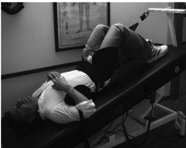
Fig 2. Photograph of vibration inversion therapy. The patient was inverted approximately 20° and vibrated at approximately 25 Hz. This procedure was performed at every office visit for the entire 8-week trial.

sion of the MUA, the patient was taken by hospital bed to recovery and was discharged without any intra- or postoperative complications. The patient was instructed to relax for the rest of the day and report back for days 2 and 3 of the serial MUA. Before days 2 and 3 of the MUA, the patient was assessed to document any subjective and objective improvements following the first MUA procedure. Subsequent MUAs are not administered if functional or subjective improvements are not observed, or if the patient improves 80% or more after the first MUA. However, a second and third MUA is scheduled if the patient makes an approximately 50% to 70% improvement following the prior MUA. 20 Each of the procedures discussed above was repeated on both days 2 and 3. When the patient was discharged on the third day, the author (MNS) prescribed 600 mg ibuprofen every 6 hours to mitigate the inflammatory response, thus inhibiting the reformation of fibroadhesions around the affected joint structures.