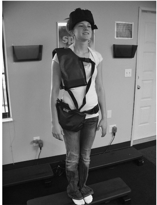
Fig 3. Image of external weighting system designed to facilitate correction of the thoracolumbar curvature while at home. She was instructed to wear these weights at home daily for 15 minutes beginning in week 3 of her care. These weights were specifically configured for her based upon her existing spinal structure, and she was radiographed while wearing the weights to ensure correct placement.

Subsequent to the stretches, low-velocity/moderate-amplitude articular manipulation was delivered to the dysfunctional spinopelvic segments. In this case, MUA techniques were performed on the thoracic spine, lumbar spine, pelvis, and hip joints bilaterally. These techniques are thoroughly illustrated by Gordon. 20 All of the procedures were performed by both of the authors in tandem. Because the patient was nonresponsive, one physician performed the techniques, whereas the other stabilized the patient. Following the conclu-