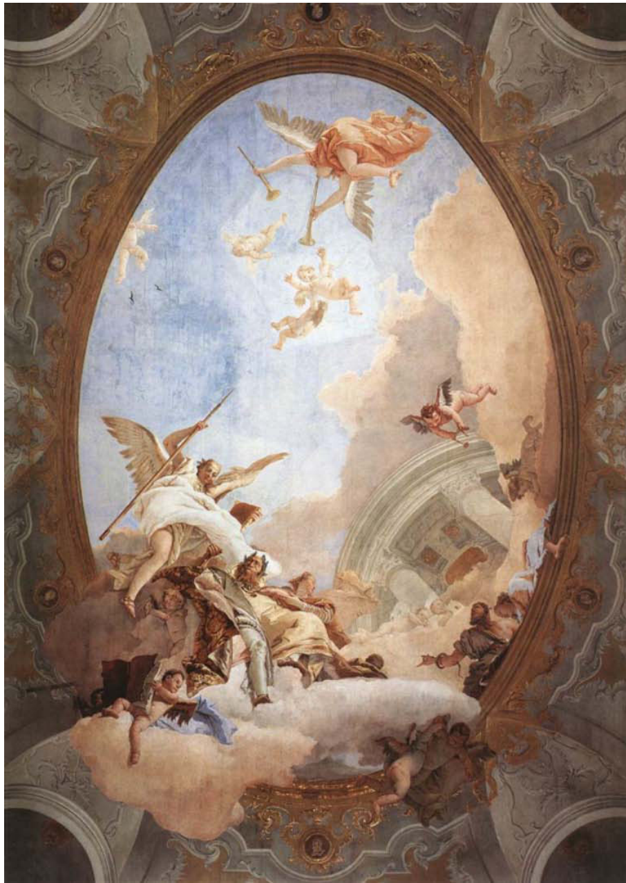
Figure 4 Example of Rococo Art Breaking Frame, Phillip Friederich von Hetsch's Allegory of Merit Accompanied by Nobility and Virtue (1758).

imaginary presenting of the sought for relationship forming incidentally. It is only in waking that it is realized that the image brings a solution to the puzzle” (Conrad [96], p. 39, my translation and emphases). That is, as we have already seen in the dilemma of the narcoleptic sleep paralysis patient, who, like the country doctor, is caught between worlds, the two worlds, conscious waking experience and the formation of autosymbolic hallucinations are mutually exclusive and yet, one “world” is