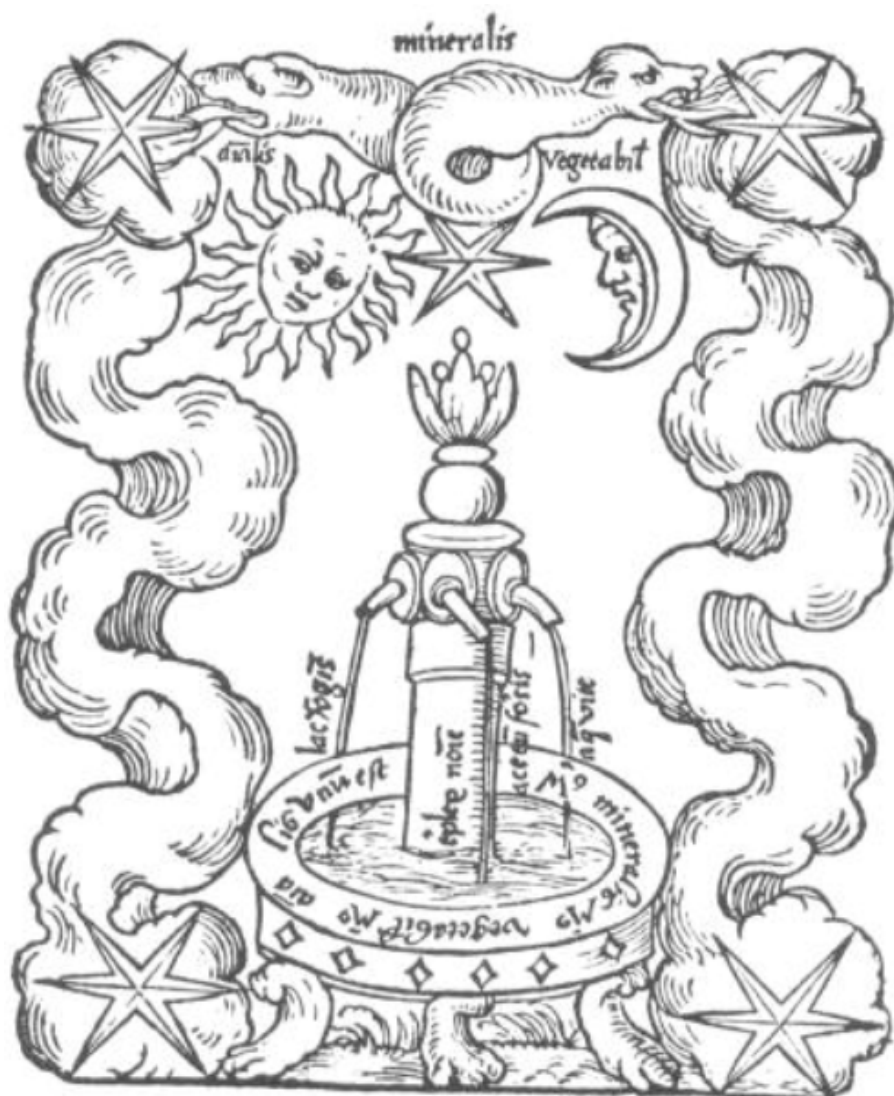
Figure 3 Woodcut from the Alchemical Work, Rosarium Philosophorum (1550): the Mercurial fountain, which Jung (1969) interprets as symbolizing the self as the ongoing integrational effort of a conjunction of opposites.

labor,” the “Castle Keep was fashioned by the most arduous labor of my body in all its parts” [10], pp. 321-8, translation modified; xv 2) smaller chambers for provisions; 3) connecting, crisscrossing passages and 4) an entrance and exit (see Kurz, 2007, p. 341). “What most disturbs the animal ‘I’ are the entrance and exit to the burrow... secured by a labyrinth” [55], p. 337). All the more remarkable that the animal-narrator should choose - after discovering that the rustling-noise of the invading other has penetrated as far as his Castle Keep - to perch himself just below the flimsy moss-covering (which alone keeps out the external world): “I stray so far that I find myself at my own labyrinth... Here under the moss-covering is perhaps the only place in my burrow where I can listen for hours and hear nothing. A complete