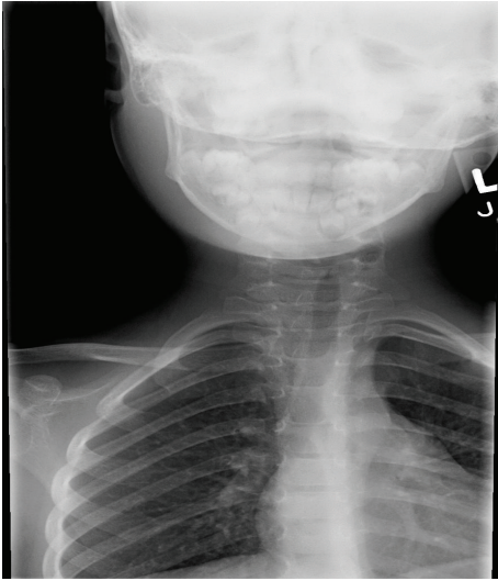
FIGURE 1: Soft tissue radiograph of the neck with deviation to the left and narrowing of upper airway.

the emergency department, he looked unwell with fever of 38.9°C, right neck and jaw swelling with multiple right cervical lymphadenopathy, the largest measuring 3 cm, with overlying erythema. He also resisted neck movements due to pain. The rest of the examination of oropharynx, ears, and nose as well as other systems were within normal limit.