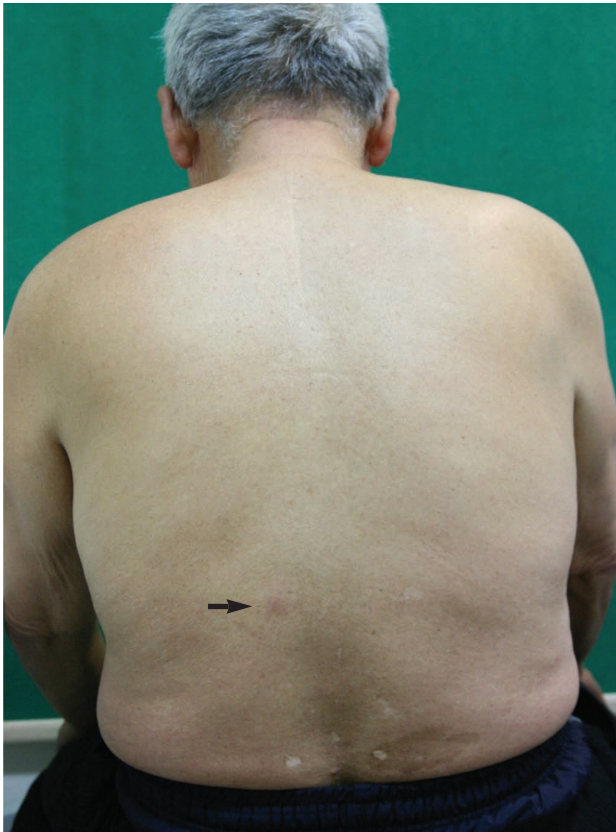
Fig. 1. The patient with an erythematous plaque (arrow) on his back due to infection with a Gnathostoma hispidum larva.

until 10 years of age when his family moved to Jilin, China. He lived in Jilin, China for almost 60 years, when he returned permanently to Korea in December 2003. He noted an erythematous skin lesion on his back skin 1-2 years before he moved to Korea. The lesion moved within limited regions during this time