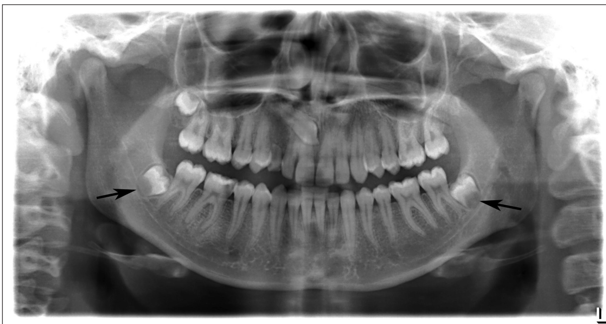
Figure 3. Apexogenesis and maturation stage of third molar teeth.