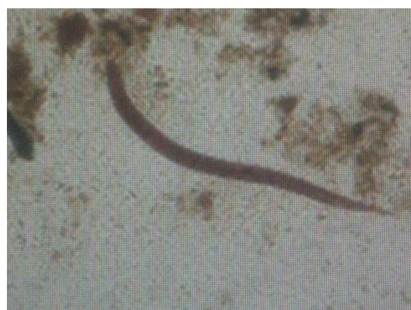
Figure 5 Lugol strained gaita sample, the parasite larvae feature.