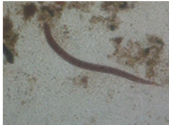
Figure 4 Direct microscopic examination of sputum.

Strongyloides stercoralis is an intestinal nematode that is widely distributed throughout the tropics and subtropics [1]. Definitive diagnosis of strongyloidiasis usually depends on the demonstration of S. Stercoralis larvae in the feces or duodenal fluid. However, in a majority of uncomplicated cases, the intestinal worm load is low