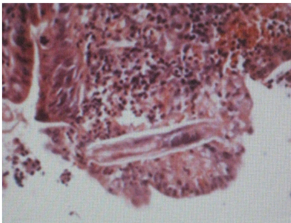
Figure 3 Strongyloides larvae are shown in gastric gland and duodenal crypts.

When immunosuppression develops, autoinfection accelerates and hyperinfection occurs. Hyperinfection has been associated with large numbers of parasites. The larvae do not spread out in the normal migration pattern but restricted to GI tract and lungs, whereas disseminated infection results in spreading to any organ. Multiple organs are affected including lungs, liver, heart, kidneys and central nervous system. Major complaints were fever, abdominal pain, diarrhoea, abdominal distension, weight loss, vomiting, cough, anemia, hemoptysis [7-11].