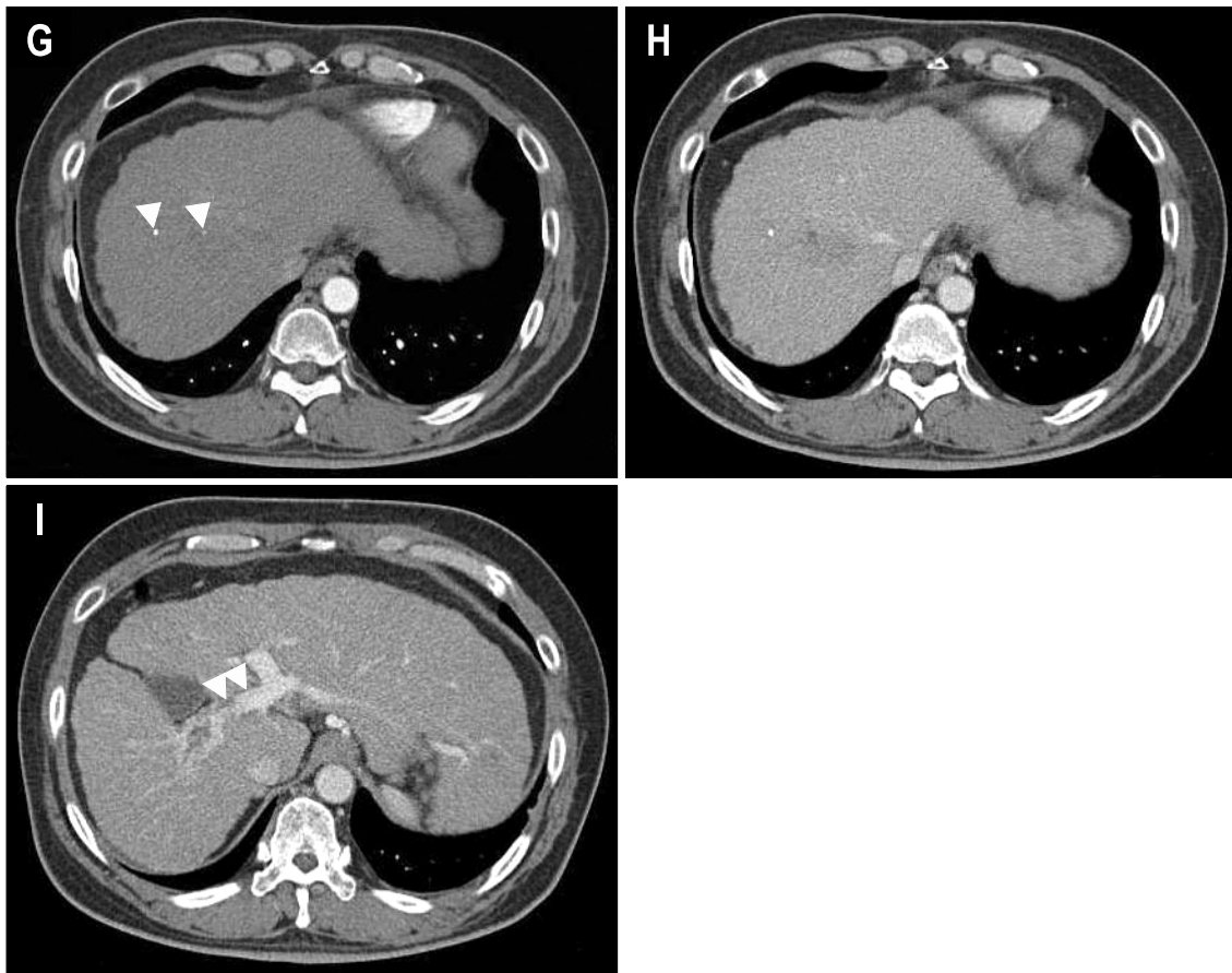
Fig. 1. Continued.