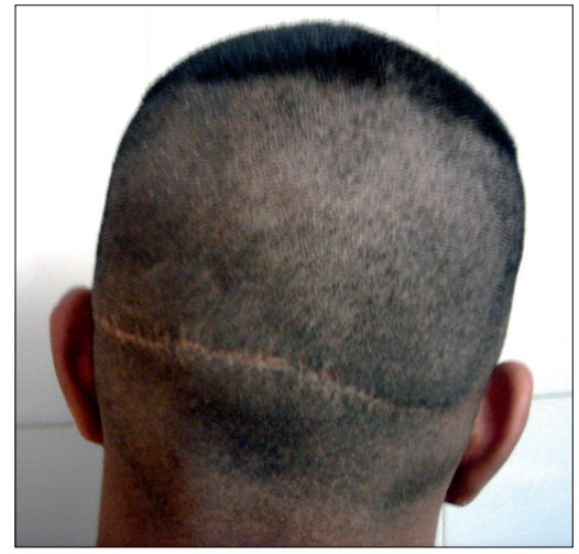
Figure 2: Donor area after strip surgery

The extracted graft may consist of 1 to 4 or rarely even 5 or 6 hairs [Figure 4]. This is the most time consuming and tedious part of the whole procedure. After the extraction