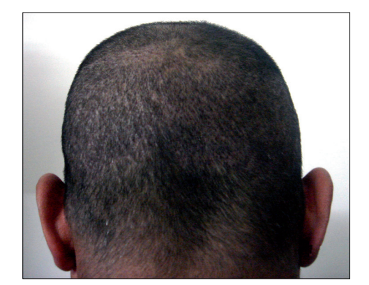
Figure 1: Donor area after FUE hair transplant after 7 days

In FUE, the extraction of intact follicular unit is dependent on the principle that the area of attachment of arrector muscle to the follicular unit is the tightest zone. Once this is made loose and separated from the surrounding dermis, the inferior segment can be extracted easily. Because the follicular unit is narrowest at the surface, one needs to use small micropunches of size 0.6–0.8 mm and therefore the resulting scar is too small to be recognised [Figure 1].