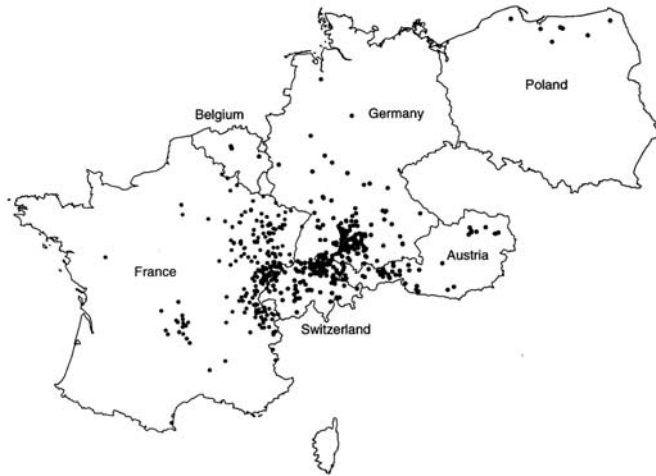
Figure 2. Regional distribution of autochthonous alveolar echinococcosis in Europe, from 532 diagnoses ascertained from 1982 to 2000. Dots represent place of residence (at time of diagnosis or last medical record) of 1–5 patients. In Austria, Belgium, Germany, and Poland, administrative units for locating patients are the municipality; in France and Switzerland, dots are placed at random in larger units (“Arrondissement” for France, “Kanton” for Switzerland).

By December 2000, 73.0% of the patients were alive, 21.3% had died, and 5.7% were lost to follow-up (Table 5). Of the patients still alive, disease activity was assessed at their last clinical examination as follows: cured (20 patients, 4.9%); stable or regressive (226 patients, 55.4%); or progression, sequelae, or complications caused by larval growth or occurring after intervention (43 patients, 10.5%). An assessment was not provided for 119 patients (29.2%); many of them had been diagnosed recently, and treatment had just begun. Death was definitely associated with alveolar echinococcosis in 13 (10.9%) of the 119 cases; in 15 cases (12.6%) death was probably related to this disease. In 20 patients (16.8%), death was definitely independent of the diagnosis of alveolar echinococcosis. No assessment was available for 71 patients (59.7%).