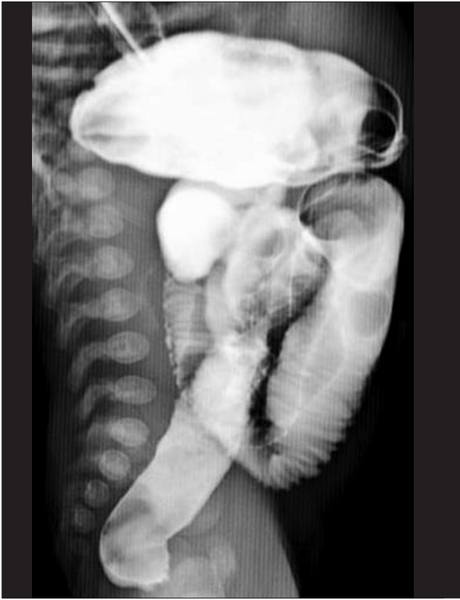
Figure 3: Lateral radiograph from a barium meal follow-through study shows the short length of small bowel with rapid transit (contrast is noted in the entire gastrointestinal tract, from the stomach to the rectum)