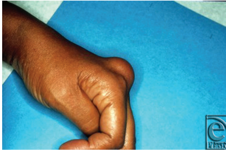
Figure 2. A 52-year-old woman presented with a subcutaneous lipoma on the dorsum of the left hand. The mass, located between the second and third metacarpals, was mobile with respect to the overlying skin but fixed to underlying structures.

Both CT and MR imaging are reliable for localization, 48 diagnosis, 45,48,49 size estimation, 49-51 as well as evaluation of bony involvement. 34,52 Superior to plain-film radiographs, three-dimensional imaging allows for preoperative planning of approach, incision, and extent of dissection. 48,53 Magnetic resonance imaging is preferable as it is both highly sensitive and specific for diagnosis. 54 However, ultrasound may be used as a reasonable and cost-effective alternative if the suspicion for malignancy is low 55 and the tumor is not contiguous with surrounding neurovascular or bony structures. 40