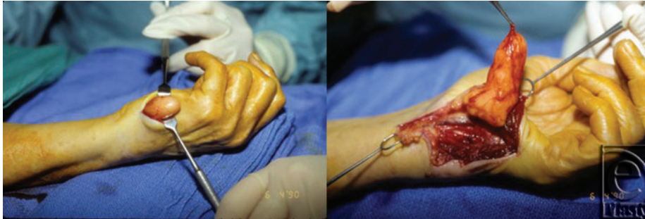
Figure 3. A 72-year-old woman presented with a lipoma of the left hypothenar eminence. The patient complained of swelling and tenderness over the ulnar aspect of the hand with numbness and tingling in the left ring and little fingers. Intraoperatively, the tumor was found to extend into Guyon's canal and could be traced to originate from the bifurcation of the motor and sensory branches of the ulnar nerve. Two months after resection, the patient was symptom-free with full use of the hand.