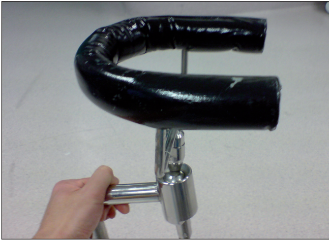
Figure 1: Horseshoe shaped headrest