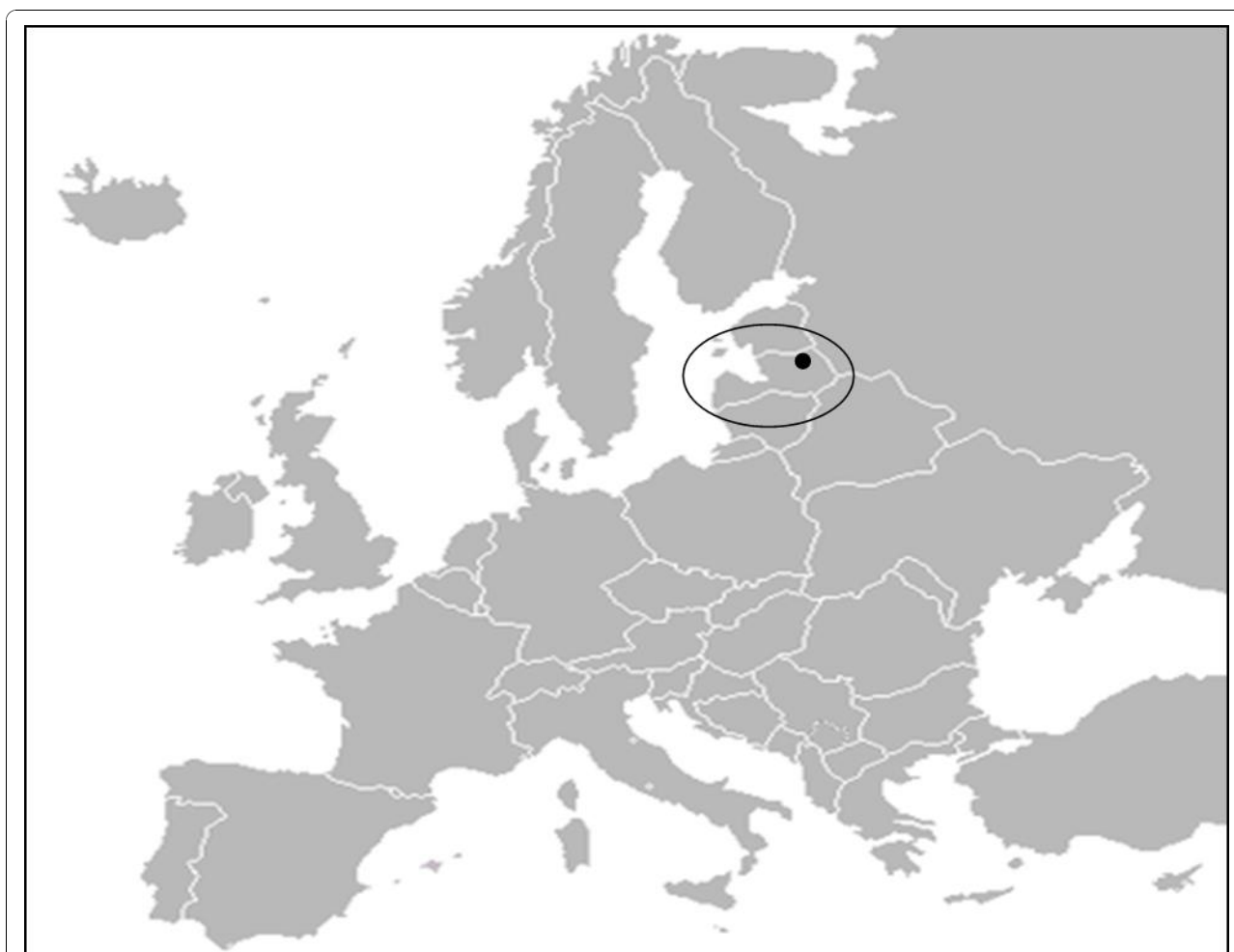
Figure 1 Geographic localisation of Latvia (encircled) with Valka district (dot).