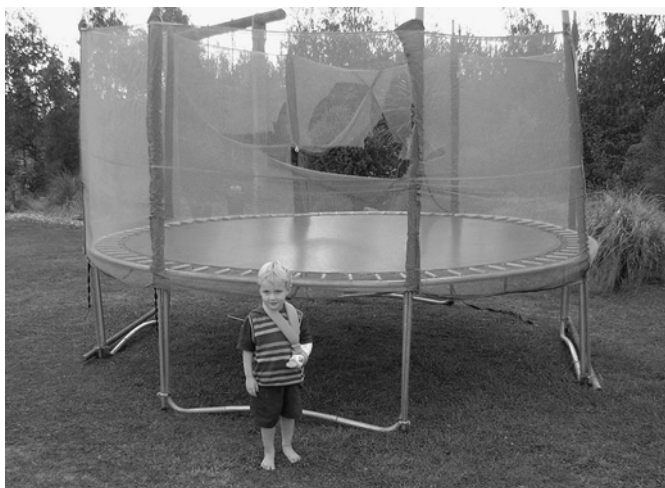
Figure 1 A typical consumer trampoline and enclosure after less than 3 years of use. The pads have deteriorated and been removed, the enclosure net is torn. The subject bounced through the hole in the net and fell to the ground, fracturing his wrist (with permission from Dr S Gooch, University of Canterbury, New Zealand).

specific injury causes, tracking them over time to ascertain whether unwanted injury causes are in decline. For example, if enclosures were becoming widespread and stopping children falling off, then over the period 2002 to 2007 a decline would be expected in the proportion of falling-off injuries.