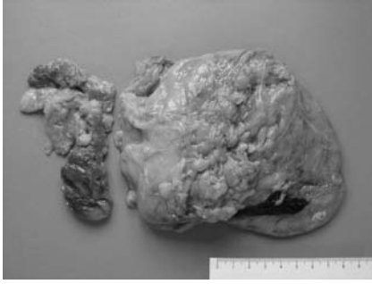
Figure 2. Retroperitoneal lipoma after its removal.