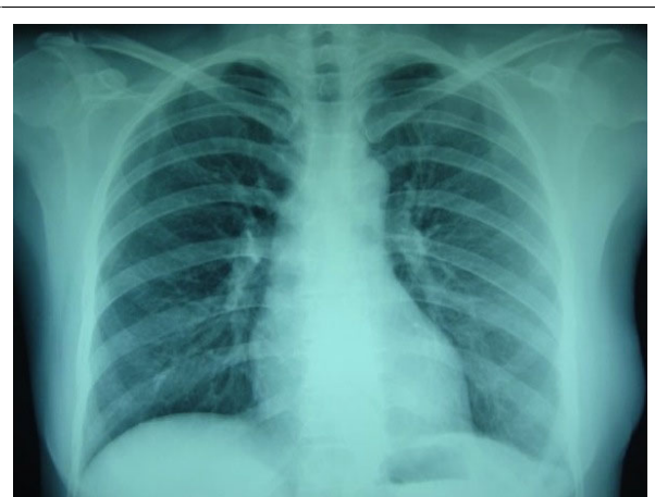
Figure 3 Chest X-ray of the patient in Fig. 1 at the end of postoperative 3rd year shows that left diaphragm is in normal position and lung is fully expanded.