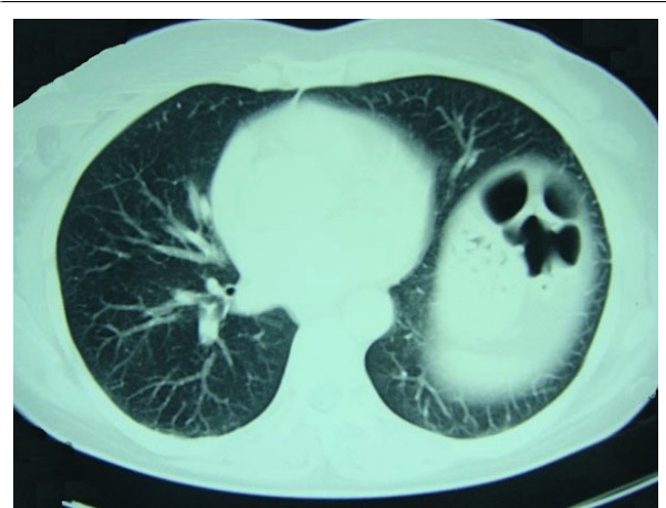
Figure 2 Spiral CT of the patient in Fig. 1 shows the atelectasis in left lower lobe, and relocation and retraction of mesenteric adipose tissue and colon loops towards diaphragm.

Preoperative pulmonary function tests showed a clear restrictive pattern. Mean preoperative FVC was 56.7 \pm 11.6\% and FEV1 65.3 \pm 8.7\% in spirometry. FVC and