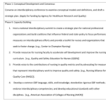
Figure 2. Initial Strategies to Accelerate Interdisciplinary EBP