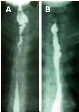
Figure 2 Barium swallow image of a stricture. A: A complex resistant esophageal stricture; B: The opened stricture after intralesional steroid injection and balloon dilation.

injected into it, contracture will presumably not occur [10] . Corticosteroids also decrease the fibrotic healing that appears to occur after dilation [38] . Gandhi et al [27] observed that with corticosteroid injections and dilations, longer corrosive strictures became shorter with time and thus more amenable to nonsurgical treatment.