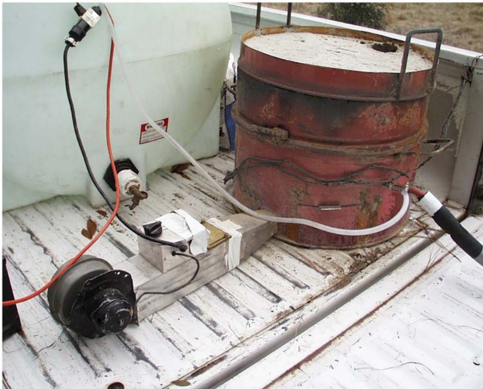
Figure 5. Modified automobile heater fan, powered by a 12-v marine battery. The tapered outlet increases the air velocity entering the bottom of the kiln.