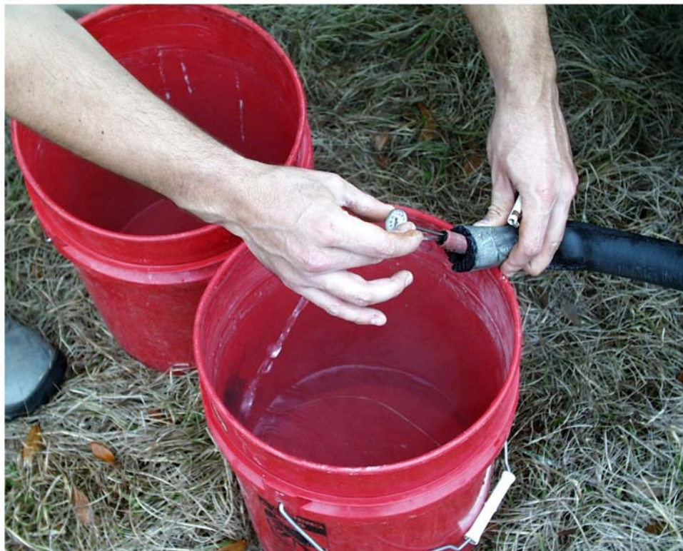
Figure 8. Measuring the temperature at the hot-water outlet. Knocking down ash and keeping the charcoal topped up assures that the effluent water temperature is always between 60° and 85° C.