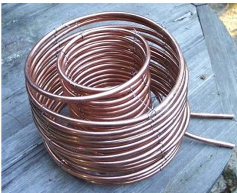
Figure 3. Flow-through copper tubing coil for heating water in the kiln. The loops of the coil are tied together with stainless steel wire.

battery). A door next to the air vent allowed ash cleanout. A lid was fashioned from the top of the oil drum, cut so that a 5 cm rim remained, that was filled with a sand/fire clay mixture for insulation (Figure 2). The filling-bung formed the chimney vent.