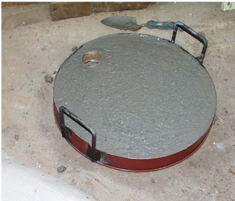
Figure 2. The kiln lid filled with sand/fireclay mixture, before drying and firing.