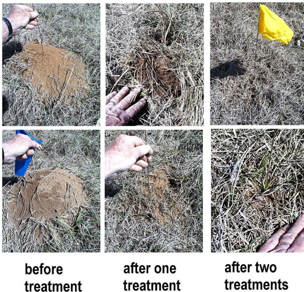
Figure 10. Typical aspects of colonies before treatment with hot water, and after one and two treatments. Most colonies were queenless after one treatment, and had only a few surviving workers, if any, after two treatments.

0.049]. On treatment plots, groups of adjacent perimeter pitfalls often had higher rates of capture suggesting that many of these ants were foraging into the plots from outside them.