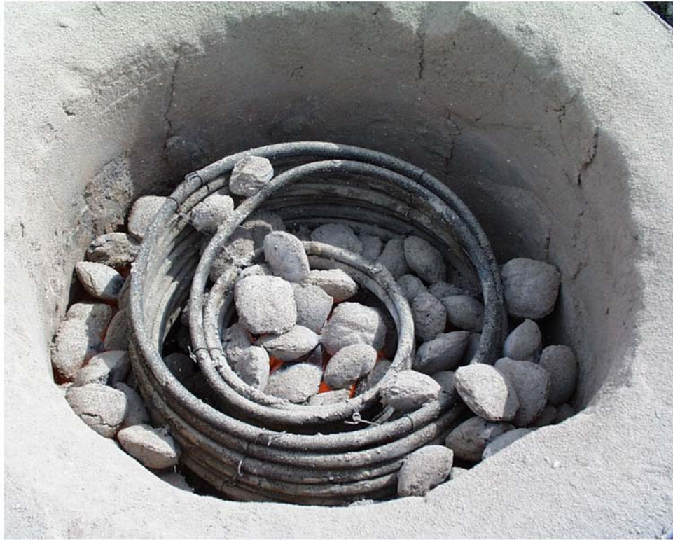
Figure 4. The coil in operation in the kiln, lid removed. Note that charcoal contacts both the inner and outer sides of both coils.