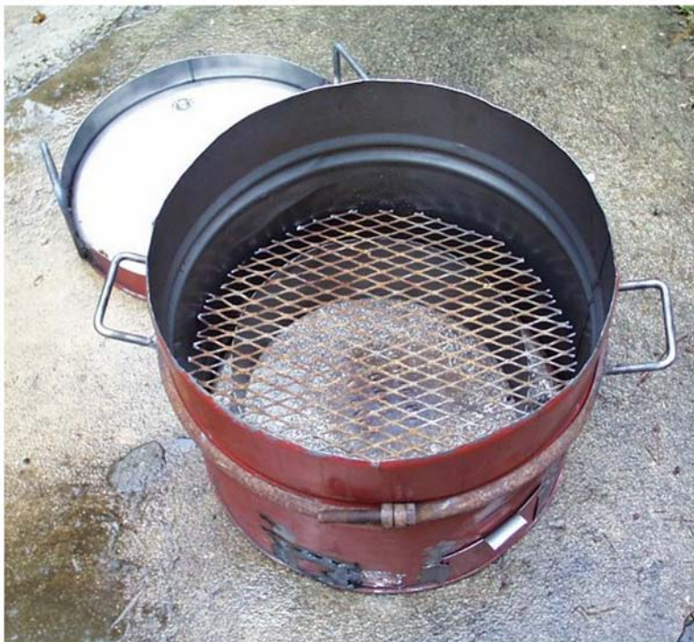
Figure 1A. Oil drum and lid, before lining with fire clay.