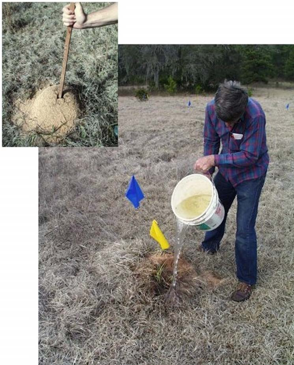
Figure 9. Pouring hot water into a fire ant colony that has been opened by piercing subterranean chambers with a stick.

months after the first year's treatment, all 5 treatment plots together contained a total of 154 colonies, but only 10% (15 colonies; average per plot 3) of these were mature, that is, large to very large. These mature colonies were probably move-ins. All colonies on treatment plots were then treated twice with hot water. Two weeks later 54 (35%) of the 154 colonies were dead, 85 (55%) has some workers but no worker brood, indicating they were queenless, and 13 (8%) had both workers and worker brood, indicating queenright status. All of these colonies were small (Figure 10), and were eliminated with a third hot water treatment. Thereafter, whereas the 5 control plots contained a total of 166 mostly large colonies, the 5 treatment plots contained no live colonies at all.