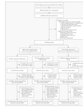
Figure 1. Enrollment and Follow-up of Study Participants

Women assigned to the nucleoside reverse-transcriptase inhibitor (NRTI) group received coformulated abacavir, zidovudine, and lamivudine. Women assigned to the protease-inhibitor group received lopinavir–ritonavir plus zidovudine–lamivudine. Women assigned to the observational group received nevirapine plus zidovudine–lamivudine. In the observational group, one woman who delivered a live-born twin and a stillborn twin was included in the live-born category. HAART denotes highly active antiretroviral therapy, and HIV-1 human immunodeficiency virus type 1.