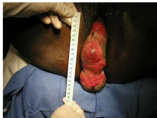
Figure 2 Vaginal views of the fibroid and inverted uterus, highlighting the size of the mass, and its necrotic nature.

We performed a vaginal myomectomy with the goal of restoring the inverted uterus to its normal anatomic state prior to proceeding with a vaginal hysterectomy. Under general anesthesia with a halogenated anesthetic agent