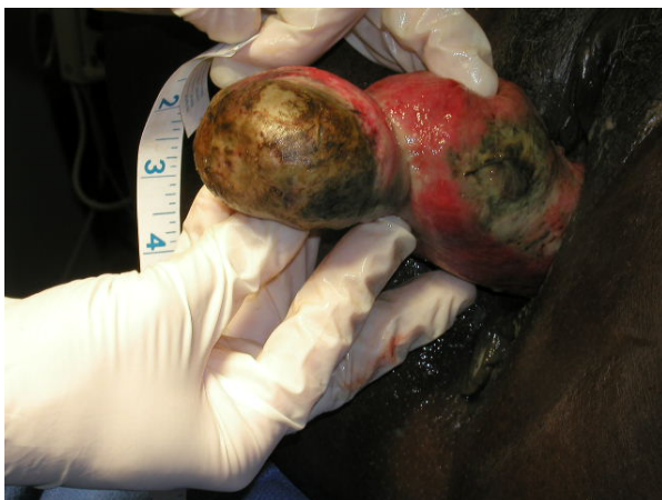
Figure 1 Prolapsed uterine fibroid attached at the uterine fundus. Notice the areas of necrosis on the fibroid as well as the endometrial lining, inverted in this case. The tubal ostia could not be visualized.

we unsuccessfully attempted to replace the uterus. Therefore we decided to open the abdomen. After packing the bowel away we inspected the pelvis (Figure 3). This is an abdominal view of an inverted uterus noting bilateral round ligaments and utero-ovarian ligaments drawn into an approximate 3 cm circle. We attempted to follow the round ligaments into the circle as classically described by Huntington with pressure exerted from the vagina but were not successful [7]. The constricting ring was too tight. After identifying both ureters, we performed Haultain's procedure followed by abdominal hysterectomy and bilateral salpingo-oophorectomy [8]. The patient was discharged on the third postoperative day and no problems were identified on two post-discharge clinic visits. The pathology report noted a 40 gram uterine leiomyoma with extensive necrosis and a 170 gram