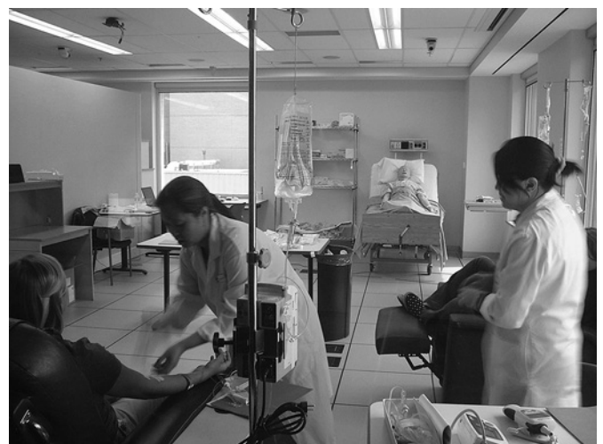
Figure 4 Nurse participant interacting with a patient actor as the confederate nurse interrupts in the simulated outpatient chemotherapy environment.