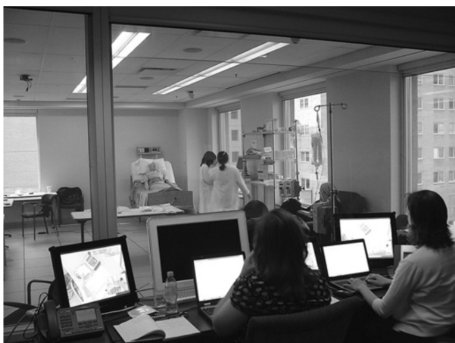
Figure 3 Usability laboratory.

items for detecting mismatches between the order and label simply instructed nurses to check the medication label against the original order but did not specify which data points to check;