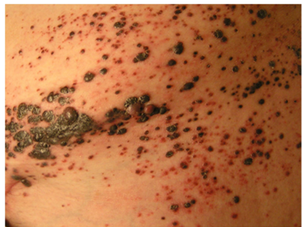
Figure 1 Unresectable melanoma in-transit metastases.

Localized administration of immune modulating agents has been shown to lead to regression of cutaneous melanoma metastases in several phase II studies. In one study, intralesional interleukin-2 given 2–3 times weekly was tested in 24 patients with one or more soft tissue or cutaneous melanoma metastases yielding complete responses in 65%