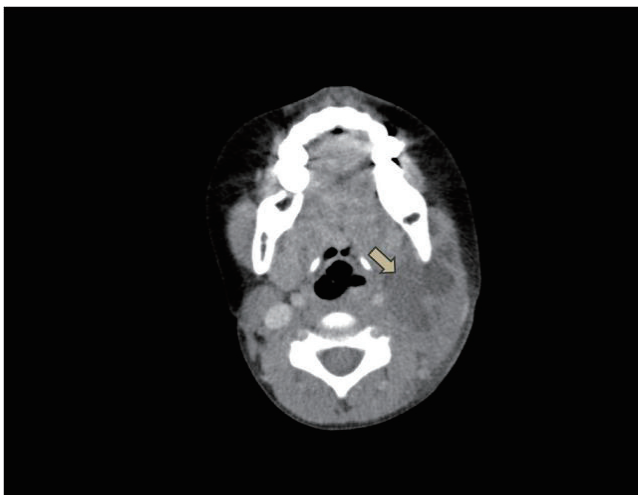
Fig. 1. Neck computed tomography scan showing a low-density lesion (arrow, about 3×4×3 cm) in the parapharyngeal space with an irregular thick wall and multiple lymph node enlargement in the left posterior cervical space.

Because of the lack of improvement of tender cervical adenopathy despite the use of antibiotics, incision and drainage of the presumed parapharyngeal abscess was planned with the patient under general anesthesia on the 9th hospital day. Purulent fluid collection in parapharyngeal space was drained. Shortly thereafter, the cervical adenopathy decreased in size and his torticollis began to resolve. A culture of the abscess revealed the growth of Staphylococcus aureus which is susceptible to clindamycin, erythromycin, and vancomycin. However, ceftriaxone was not included in the antibiotic susceptibility test. No coronary artery lesion was noted on repeat echocardiogram. On the 14th hospital day, desquamation of the fingertips was noted. A repeat CT scan on hospital day 16 showed decrease of fluid collection (about 0.5 cm) in the left parapharyngeal space compared with the previous CT scan (Fig. 2). The patient was discharged with low dose aspirin and oral antibiotics on hospital day 16.