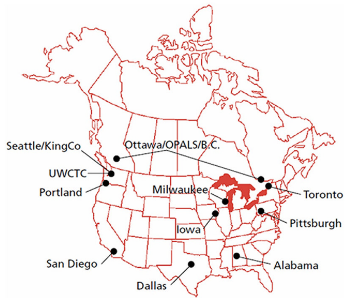
Figure 1. Map of Sites Contributing to the Resuscitation Outcomes Consortium Epistry Database

San Diego was excluded from this analysis because of a lack of data. OPALS/B.C. = Ontario Prehospital Advanced Life Support/British Columbia; UWCTC = University of Washington Clinical Trials Center.