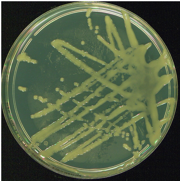
Figure 2 Appearance of Corynebacterium mucifaciens colonies obtained in 24 h of incubation: circular, mucoid, slightly yellowish and about 2 mm rods.

positive, showed a positive reaction for pyrazinamidase, pyrolidonyl arylamidase, alkaline phosphatase, and acid production from glucose and maltose, were negative for oxydase, nitrate reduction, and urease. By this time, the attempt to identify the organism gave the numerical code 6100125 which corresponded, according to the system's database with the identification of Corynebacterium striatum/amycolatum with 88.7% similarity. Subsequently, a second API corynesystem was realized