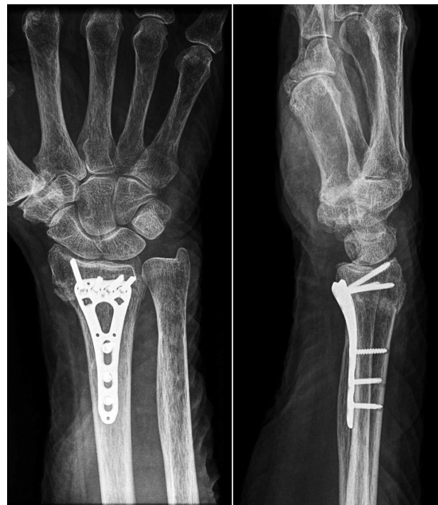
Figure 2 X-ray of volar locking plate.

A retrospective analysis of 24 distal radius fractures in patients aged over 75 years treated with a volar fixed-angle