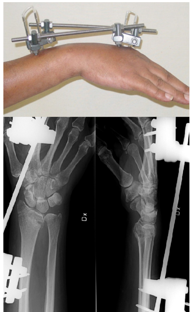
Figure 3 An external fixator.

One technique to prevent fracture displacement is to use percutaneous pinning as an augmentation to external fixation. Biomechanical studies have shown increased stability. 44