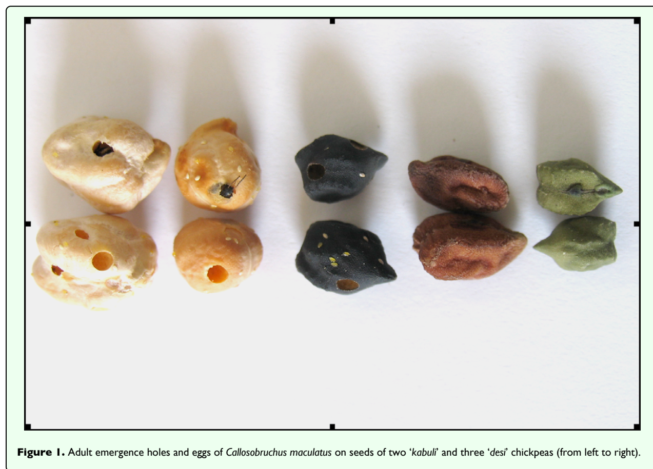
Figure 1. Adult emergence holes and eggs of Callosobruchus maculatus on seeds of two 'kabuli' and three 'desi' chickpeas (from left to right).

so as to avoid the escape of C. maculatus adults, and provide air circulation. The insects were allowed to remain there for the purpose of oviposition for one week, and were then removed. The genotypes were examined on biweekly basis to record the number of damaged seeds per genotype by visual observation. Damage to seeds by C. maculatus was manifested by the round exit holes with the 'flap' of seed coat made by emerging adults (Figure 1)