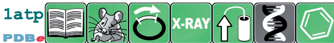
Figure 2. PDBprints for PDB entry 1atp ( pdbe.org/pdbprints ; see text for details).

Some of the icons may have either a grey or a colored background. If the background is grey, this implies that the corresponding feature, data or information is absent or unavailable. For example, Figure 2 shows the PDBprints for PDB entry 1atp (22), which immediately reveals that 1atp is a published crystal structure of a heterologously expressed mouse protein in complex with