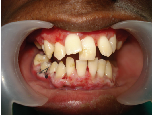
FIGURE 3: Postoperative intraoral view after 2 weeks.