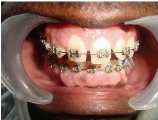
FIGURE 4: Orthodontic treatment showing excellent improvement after 10 months.

and he also had obvious implications for his aesthetic appearance. The patient's medical history appeared to be noncontributory to the development of the gingival enlargement. The patient in this report had no history of using drugs such as phenytoin, nifedipine, or cyclosporine. The patient revealed a family history which was apparently significant to the present finding. His maternal grandfather and maternal uncle had similar gingival enlargements but were deceased. The patient's mother (58 years old) (Figure 5), maternal aunt (59 years old), and sister (26 years old) (Figure 6) had similar gingival enlargement involving, to various extents, the maxilla as well as the mandible, which was treated at various points of time.