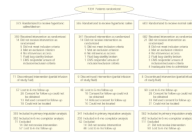
Figure 1. Trial Enrollment

Imputation analysis for 6-month neurologic outcome included all patients who received the intervention. Final completer analysis outcome data included all patients who received the intervention, defined as having the fluid connected to the intravenous line regardless of how much fluid was administered, and who completed 6-month follow-up. EMS indicates emergency medical system.