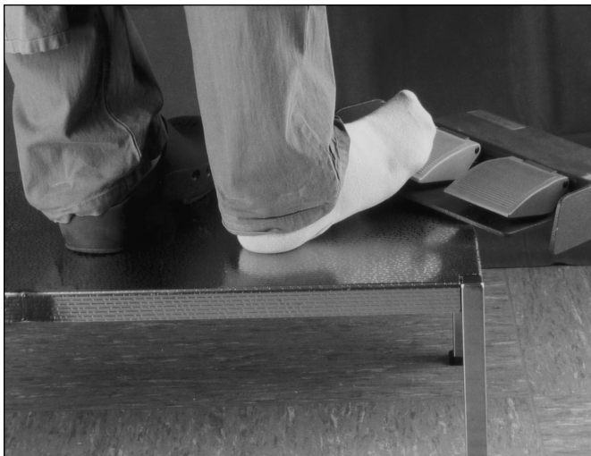
Figure 1. During surgery a small surgeon is standing on a step. The foot switch for the high frequency current is likely to drop off due to limited space on the step.

A perspex board simulated the abdominal wall of the patient lying on the top of the operating table. It was