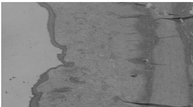
Figure 2. Histologic section revealing the epithelial lining of the splenic cyst.

Histologic examination revealed multiple splenic fragments with a total weight of 160g and dimensions of 18 cm x 14 cm x 7 cm. The bigger splenic fragment contained an empty cyst with dimensions of 9 cm x 6 cm with a fibrotic wall bearing epithelial lining ( Figures 2 and 3 ). These findings were indicative of epidermoid splenic cyst.