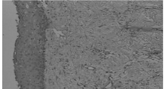
Figure 3. Higher magnification view of the epithelial lining of the splenic cyst.