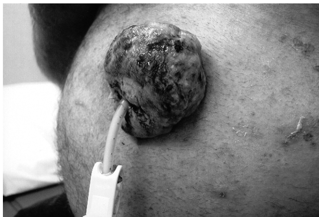
Figure 1. Large exophytic lesion around the percutaneous endoscopic gastrostomy tube.

In April 2004, the patient also underwent mandibular odontectomy, alveolectomy, and minor revision of the free flap at the alveolar process. Close to 1 month after insertion of the PEG tube, the patient stated he noticed some granulation tissue forming around the tube site. This progressed rapidly, but the patient neglected to seek medical attention. In July 2004, the patient was referred by his family practitioner with a large 4-cm fungating mass around his tube site. Within 3 weeks, the mass reached a size of 9 cm in diameter ( Figure 1 ). An incisional biopsy was obtained that revealed SCC, and it was felt that this came from the patient's original head and neck cancer. Upper endoscopy was performed that showed the tumor around the bumper or mushroom within the stomach ( Figure 2 ). Further evaluation by computed tomography (CT) showed a large mass extending through the abdominal wall ( Figure 3 ). Metastatic workup to include CT of the head, neck, chest, and abdomen were negative, except for the mass in the abdominal wall and stomach. Radiation-oncology consultation was obtained, and the patient subsequently received 4500 rads, 25 fractions to the abdominal wall. A significant reduction in the size of the mass was obtained. Several weeks later following radiation therapy, the patient had a CT scan that did not