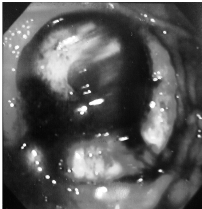
Figure 2. Endoscopically visible tumor around the percutaneous endoscopic gastrostomy tube bumper.