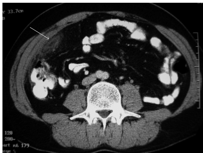
Figure 1. Contrast-enhanced computed tomographic scan of the abdomen revealed streaking of the greater omentum with a local mass of fat density in a whirling pattern (arrow).