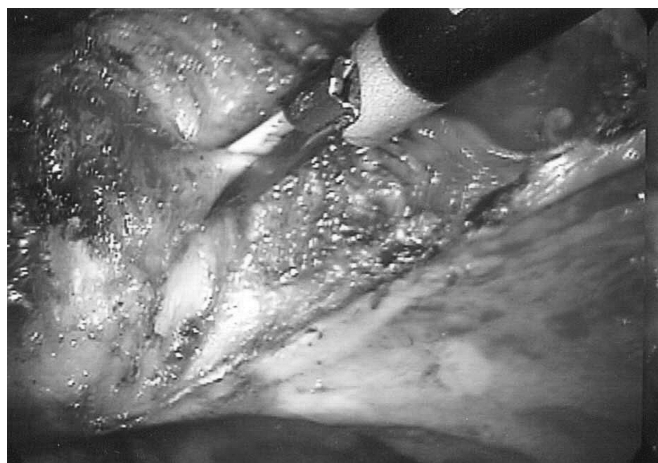
Figure 2. After incising the cardinal ligament, the pliant vaginal wall is palpated laterally, anteriorly, and posteriorly to confirm the location of the cervicovaginal margin. Then, the vaginal wall is incised into with the Ultrasonic scalpel.

OH, USA) suture in 3 or more figure-of-eight (technically spiral) sutures with Semb graspers and a Wolfe needle driver (#8393.502, Richard Wolf Surgical Instruments, Vernon Hills, IL, USA), fixing the vaginal angle to the uterosacral ligaments for suspension.