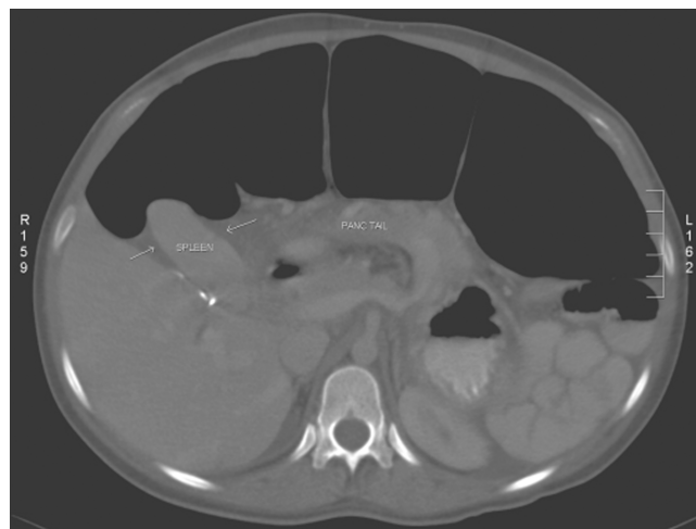
Figure 2. Computed tomographic scan shows the spleen in the right upper quadrant, adjacent to the liver. There is significant displacement of the pancreatic tail into the splenic hilum, as well as a very large air-filled transverse colon.