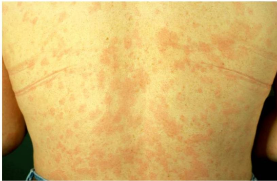
Figure 1 the typical rash of the Schnitzler syndrome, which corresponds to a neutrophilic urticarial dermatosis: rose to red macules and/or slightly raised plaques. The lesions are usually not itchy and vanish within hours without sequel.