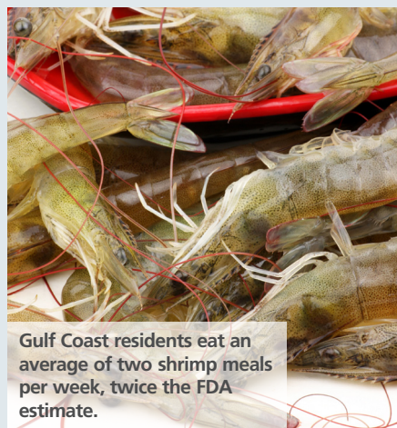
Gulf Coast residents eat an average of two shrimp meals per week, twice the FDA estimate.

The Natural Resources Defense Council reports the FDA underestimated seafood consumption by Gulf Coast residents in developing their June 2010 protocol for determining safe seafood levels of