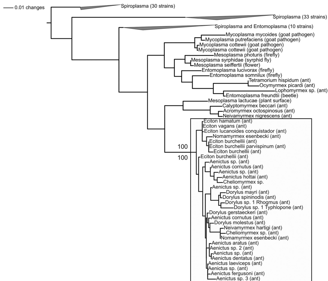
FIG. 2. 16S rRNA phylogeny depicting relatedness of Entomoplasmatales associates from army ants and other organisms. Maximum likelihood was used to construct a phylogeny based on an alignment of 122 16S rRNA sequences from bacteria within the order Entomoplasmatales . The tree was rooted using Mycoplasma genitalium as the outgroup (not shown). Analyzed sequences included nonredundant ant associates from this study (i.e., one representative per species per 1% phylotype), their closest relatives in GenBank (based on BLASTn searches), and selected strains from other arthropod hosts, with an emphasis on those from Drosophila , spiders, and lepidopterans. To better illustrate the main finding—a host-specific clade of microbes exclusively found in army ants (with 100% bootstrap support in parsimony and likelihood searches; “Primary Army Ant Clade”), most clades were collapsed. The full tree (with bootstrap values, strain IDs, and accession numbers but without branch lengths) can be found in Fig. S2 in the supplemental material. Strains from ants are named after their hosts, and the host/environment of origin is indicated for all taxa in parentheses.

ated Spiroplasma comprised of gut associates and maternally transmitted bacteria.