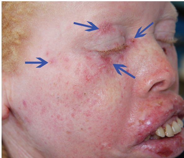
Figure 1. Multiple basal cell carcinomas of the face (arrows).

The vermilion border of the lower lip may also be more vulnerable to sunlight-induced lesions because its epithelium is thin, has a thin keratin layer and has a lower melanin content. 2 Smoking