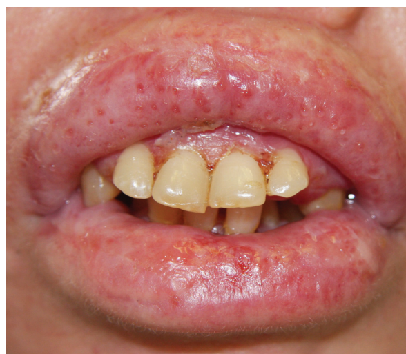
Figure 3. The lips 4 weeks after treatment.

It has been reported that in Africa, black persons with albinism are often exposed to social discrimination as a result of superstitious beliefs. 19,20 As a result of the stigma attached to albinism,